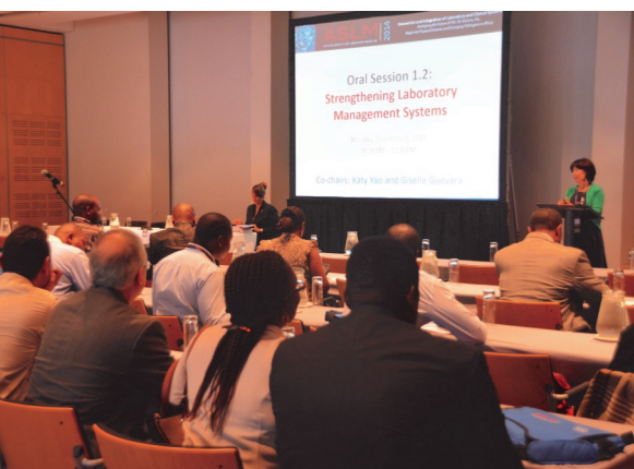
One of many SLMTA sessions at ASLM2014

Have a happy holiday and a productive 2015. Keep the SLMTA fire burning!!!